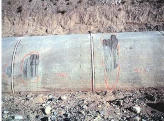
Photo 1 - Reclamation's 6.4 meter (252-inch) PCCP Pipe Distress Detected Acoustically