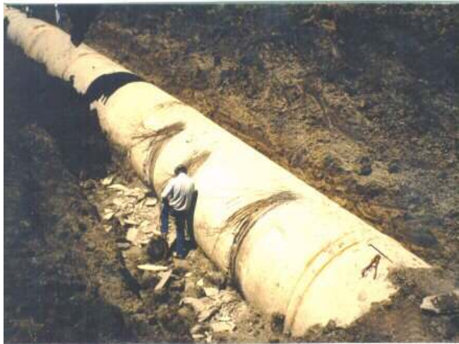
Photo 2 - 1.8 PCCP Pipe Distress Acoustically